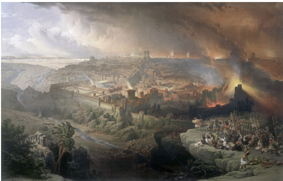
Jerusalem Destroyed 70 AD Click to enlarge